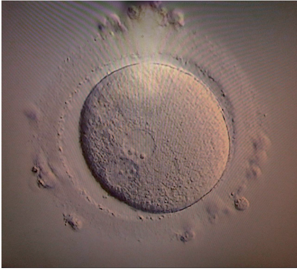
Fig. 3. — 2PN zygote from double rescue egg retrieval and IVM.

urine LH test is positive. In this case we assumed that the urine test had been positive on the evening prior to day 11. This was reinforced by the strongly positive urine LH test on the morning of day 11 and the strong peri-follicular blood velocity which was suggestive of impending ovulation. We now assume that the first attempt at egg collection which was performed 18 hours after the presumed positive urine test was performed too early but we were anxious to avoid follicular rupture before the attempt was made. Two factors influenced the decision to repeat the OR procedure. Firstly granulosa cells had been identified in the aspirate which indicated the likelihood of a cumulus being present but adherent to the wall of the follicle. The second was the strong peri-follicular flow which had an even higher velocity to that found the previous day. The implication from this was that angiogenesis was still continuing and the prospects of obtaining an oocyte on repeat OR was reasonably good. Peri-follicular velocity is directly correlated with oocyte retrieval and the quality of oocyte (Nargund et al., 1996). In this case, the patient was warned that if the follicle had filled in with blood clot then no attempt would be made but fortunately the appearance of